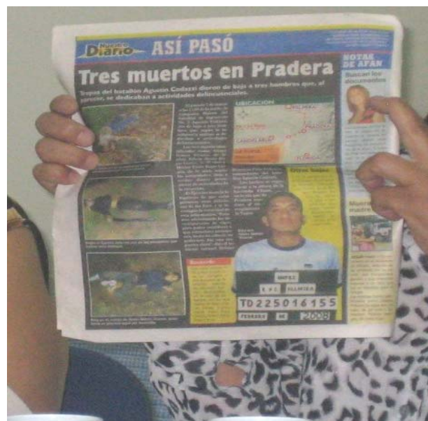
Fig 4. Newspaper report of the killing of 3 students