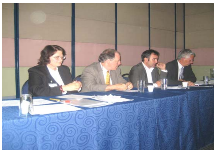
Fig 1. Press conference in Bogota